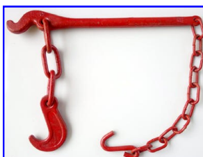
Load Binder: (shown at left)