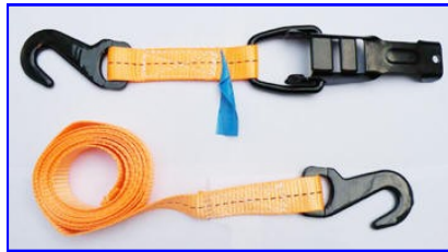
Auto Lashing: (shown at left)