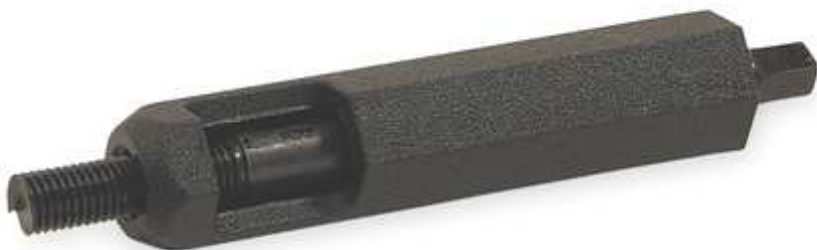
P-SB THREADED INSERT INSTALLATION TOOL

REPAIR KIT: TRUSS HEAD MACHINE SCREW • FENDER WASHER • WEB • THREADED INSERT • BALL