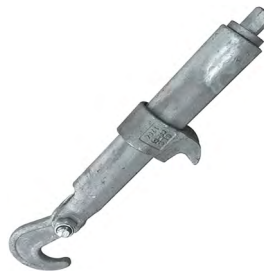
CHAIN SPEED LASH