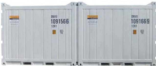
SHORE CONTAINER CONNECTION SYSTEM