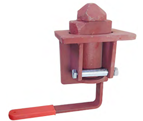
FLAT BED TWISTLOCK