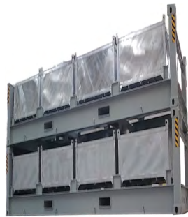
FLAT RACKS & BINS