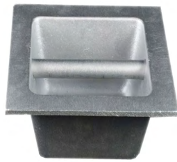
ALUMINUM TIE POINTS