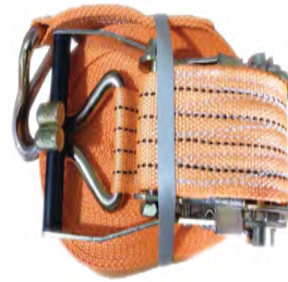
STRAP TIE DOWNS