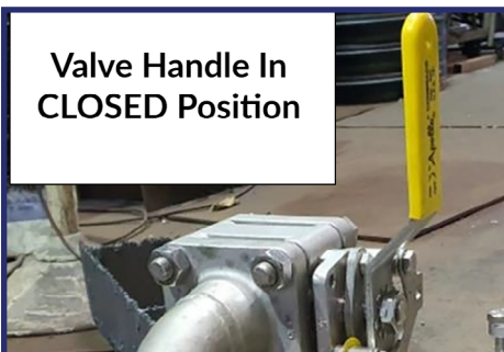
Cover Cannot Be Put Back On With Valve Closed