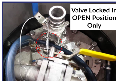
Valve Lock Prevents Unsafe Operation