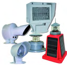
LIGHTS & LANTERNS Explosion Proof – ATEX