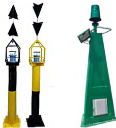
LIGHT POLES WITH DAY MARKS