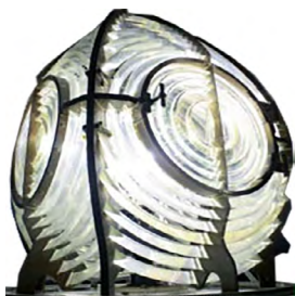
RESTORATION Lights and Lenses