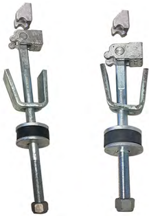
QUICK ACTING CLEATS Various Styles and Lengths