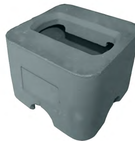
LIFTING FOUNDATIONS Single, Double, or Flush