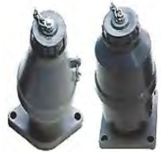
NON RETURN DRAIN VALVE 2 or 4 Bolt Type