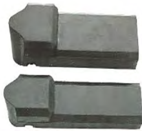
END RUBBER PACKING Various Sizes and Styles