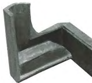
CORNER RUBBER PACKING Various Sizes and Styles