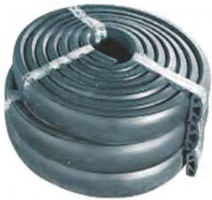
STRAIGHT RUBBER PACKING Sponge or Solid Rubber